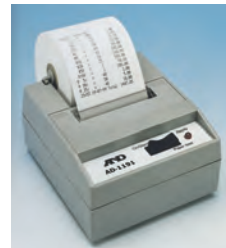
AD-1191 Dot Matrix Compact Printer