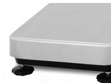
Remote Scale Remote Scale Option using A&D SB Platforms or most other manufacturers' load cell platforms.