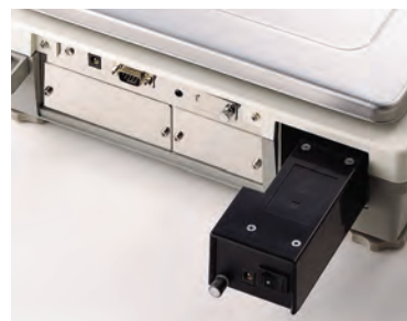
Rechargeable Battery Rechargeable Battery Option for portable operation.

All FC-i and FC-Si models utilize ACAI, A&D's exclusive Automatic Count Accuracy Improvement. ACAI combines the two most critical performance requirements of a counting scale: count accuracy and operation efficiency. Initial Average Piece Weight can be determined through an operator's choice of fixed, random, keyboard entry, or memory recall.