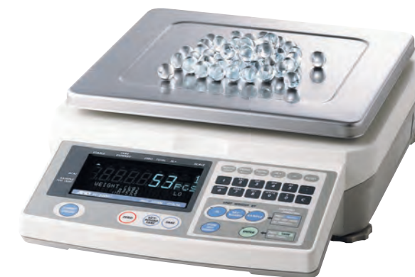
FC-i 1,000,000 parts Internal Resolution