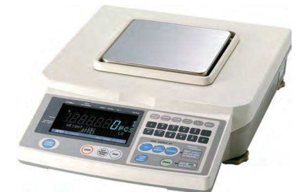
FC-Si 5,000,000 parts Internal Resolution