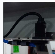
Automatic air blowing