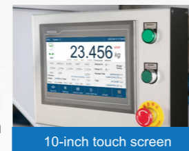
10-inch touch screen

User-friendly interface design, vivid display, easy to operate.